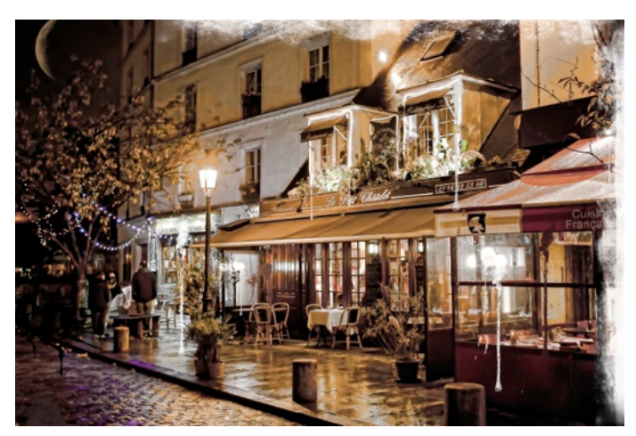
Latin Quarter in Copper by Evie Carrier

Currently Evie is experimenting with water color art (as is exemplified by many of the works currently on display), while Mike remains more the traditionalist.