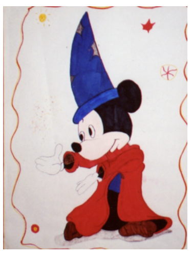
A Little Magic colored pencil by Sallie Zigterman