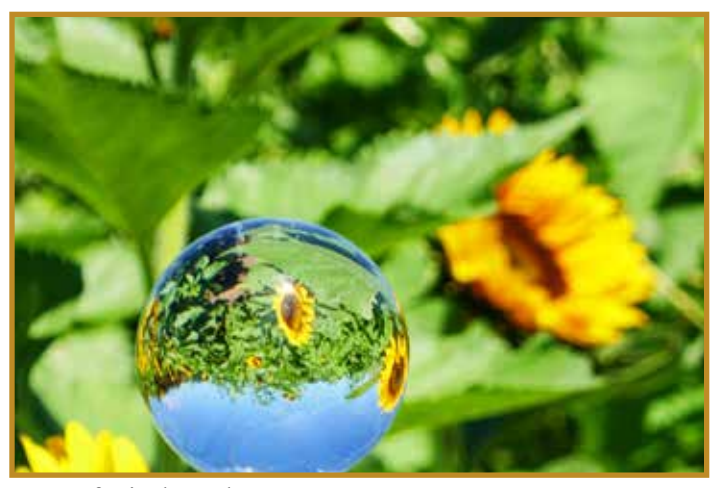
One of Linda's photos.

(Editor's note: Websites often have photos that represent their location during its peak growing/blooming time. This does not mean that those flowers are in bloom at this very moment. When possible, call ahead to inquire. Check the Facebook page, too, if there is one. You'll save yourself frustration by arriving too early or too late.)