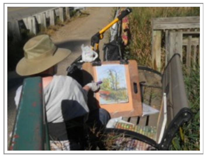
Plein air painting in October, at Waterfront Park in East Grand Rapids