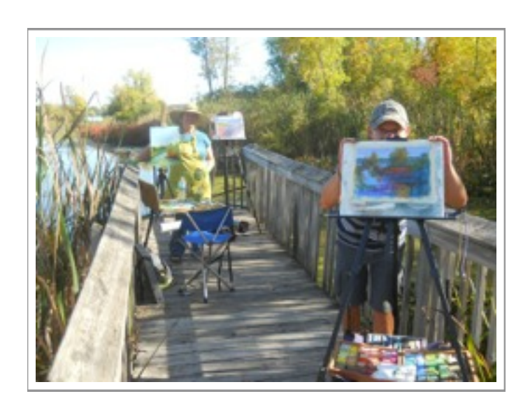
GVA Plein Air Painters

Call 517- 999-1212 or go to website: <a href="https://www.gallery1212.com">www.gallery1212.com</a> to purchase this workshop.