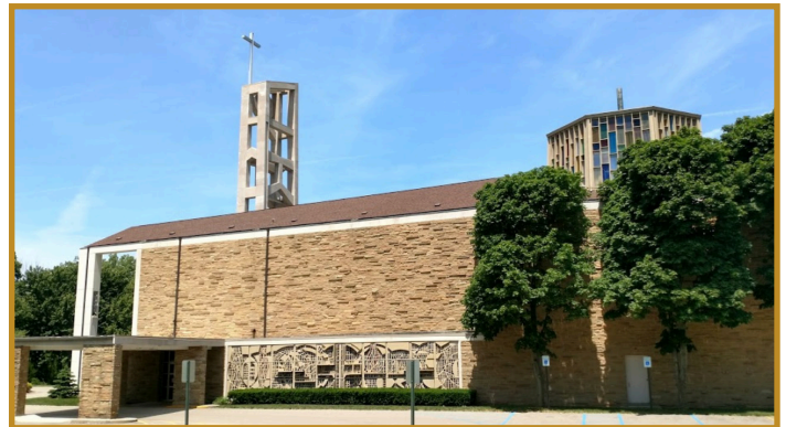
Trinity Lutheran Church, 2700 Fulton St E, Grand Rapids, MI 49506