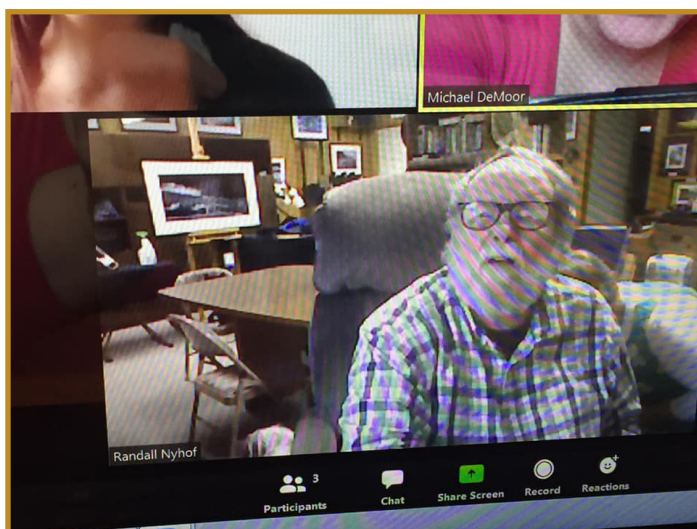
Photo attached of a Boomer trying to figure out how to activate the sound with Zoom. Photo taken by my daughter in Edmonton, Alberta, Canada. (Photo below illustrates a Boomer.)

The program for April which was scheduled for a presentation by Kevin Buist to give an update on ArtPrize for this year of course didn't happen. Any future programs are in limbo for now. We are waiting to see how this virus situation plays out.