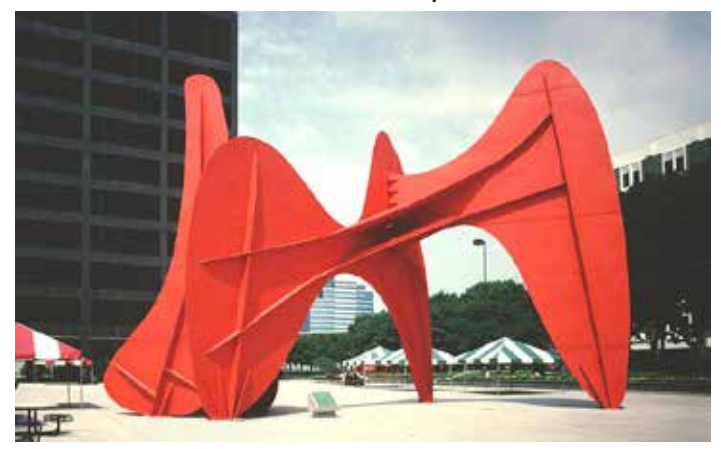
La Grande Vitesse, installed in 1969

Calder died of a heart attack in 1976, shortly after a retrospective show at the Whitney Museum in New York opened. His fame continues however, and his many sculptures and mobiles around the world are admired by new generations. He called his large pieces "stabiles" in reference to his many "mobiles" that are