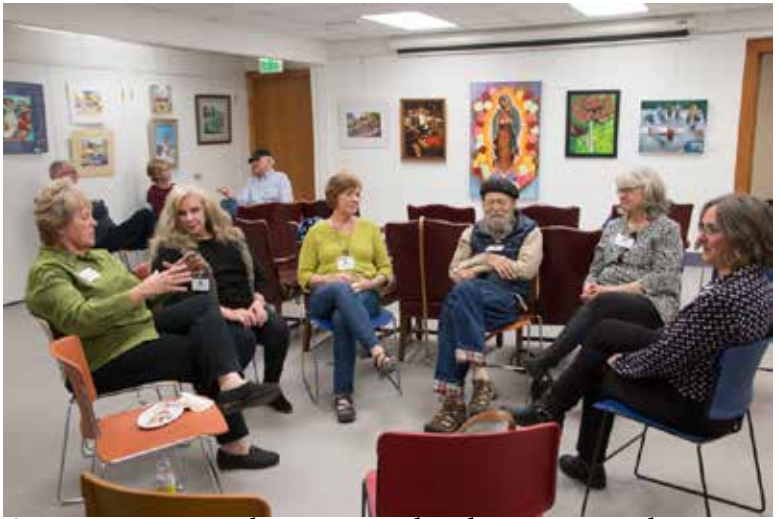
Our new space easily accommodated a great attendance.