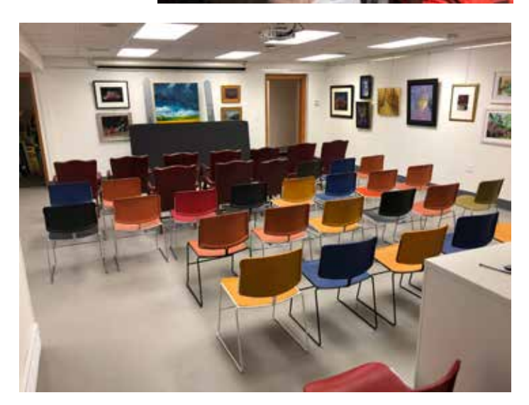
Ready for action! Take a good look, artists, at what a clean studio looks like. What are the chances it will ever look this nice again? Thanks to all who helped to make our new home functional and beautiful.