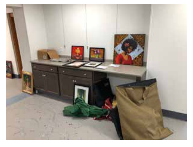
We Decked the Halls!

The Christmas party was a wonderful way to begin the next GVA adventure at our beautiful new studio on Service Road.