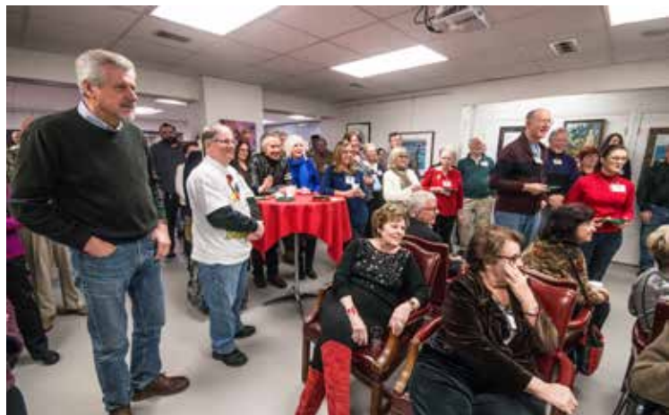
Beautiful art graced the pristine walls, and the food and fellowship made the evening a night to remember. Happy Holidays and Happy New Year, everyone!