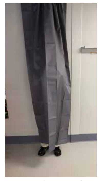
Nothing to see here.