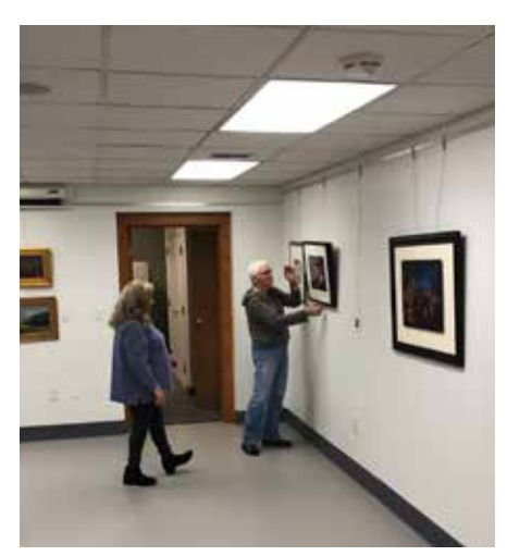
Somebody apparently needed lots of supervision.