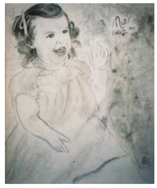
By Sallie Zigterman