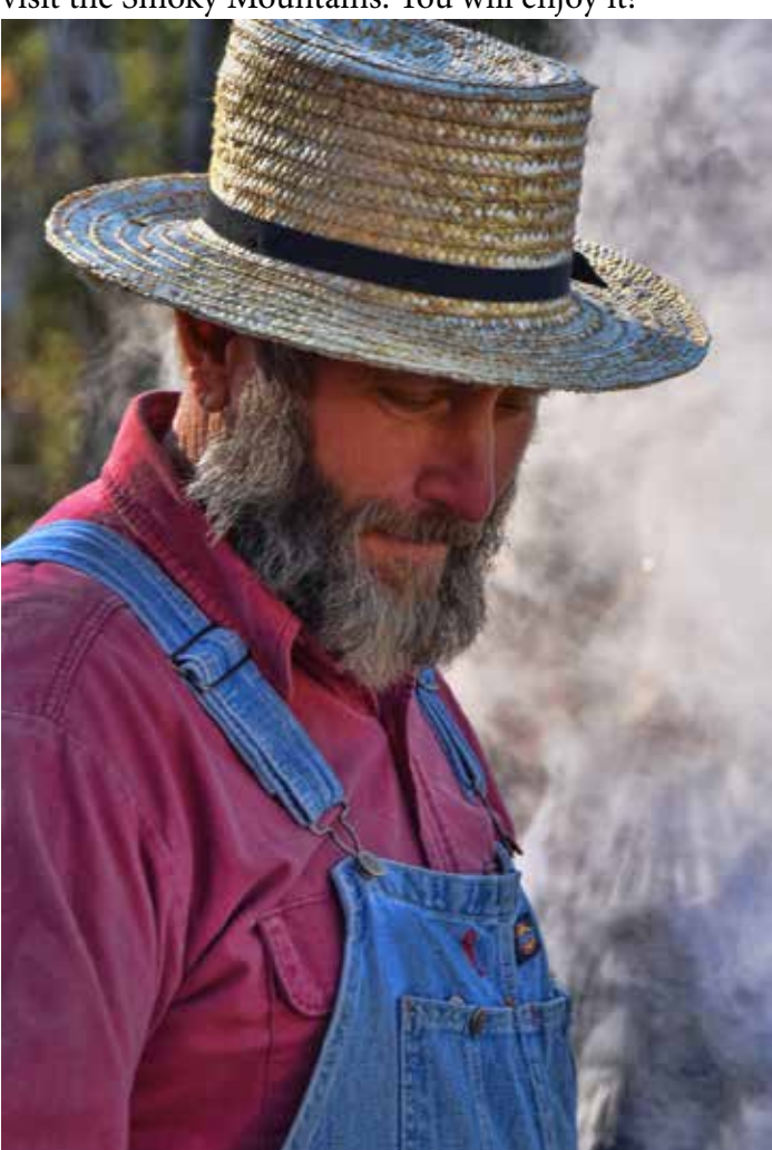
These two photos by Steve, a farmer making molasses above and a grist mill below, take the viewer back in time.

Driving through mountainous areas is very tiring because of all the winding switchbacks, but the views of mountains, buildings and wildlife are worth it as long as one takes a few breaks. If you ever have a chance, visit the Smoky Mountains. You will enjoy it!