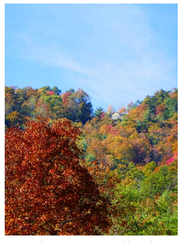
Autumn colors in Tennessee, captured by Linda.

the area where simple farmers carved out a life in the middle of this incredible beauty. Such hardships they endured! We documented our trip with photos. It's always hard to juggle taking a family shot one second and an artistic shot the next, but we are learning how to do it successfully.