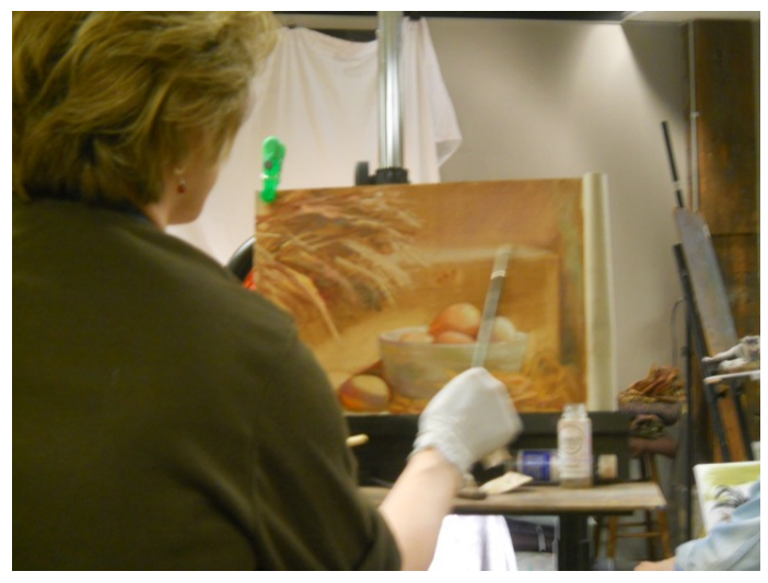
Wednesday Still Life Painting Session