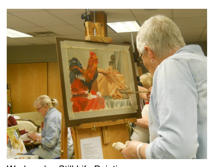
Wednesday Still Life Painting

Artists' reception will be Thursday, May 9 from 7:00 pm to 9:00 pm.